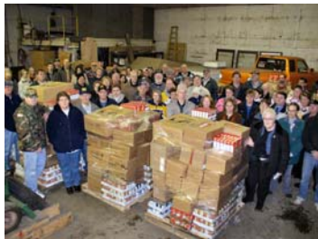
2007 Drop Off Day Photo

Last year, the Drive collected 45,643 food items and an additional $34,229.85. The food items were distributed equally to the pantries in mid-December. Then through out the year, we purchased additional food items for all of the pantries using the cash collected. Unfortunately this food only lasts the pantries a short time.